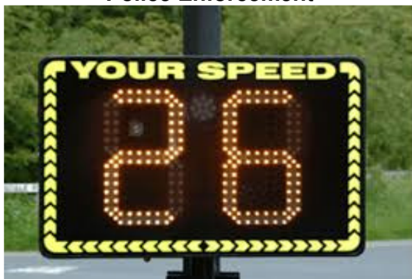
Parish/Town Council purchased SID