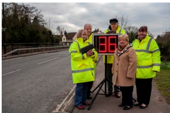
Community SpeedWatch volunteers